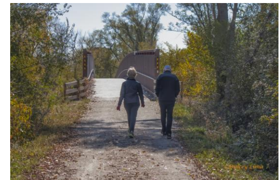
Walkers near Wayne